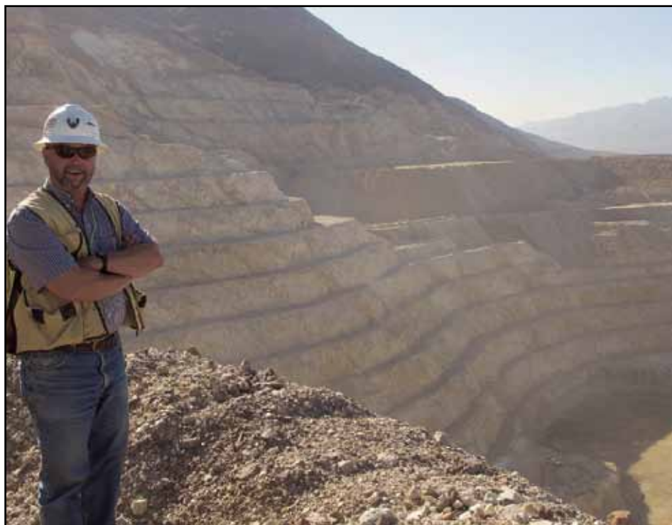
Atna Resources’ Briggs mine sold 9,695 ounces of gold for the quarter, a 26% increase over 2nd quarter results, to produce $16.6 million in gross revenue, a 41% increase over prior quarter revenue.

“This acquisition will allow Atna to reach its goal of unlocking value from the Pinson Mine,” says Hesketh. “In addition to the near term gold