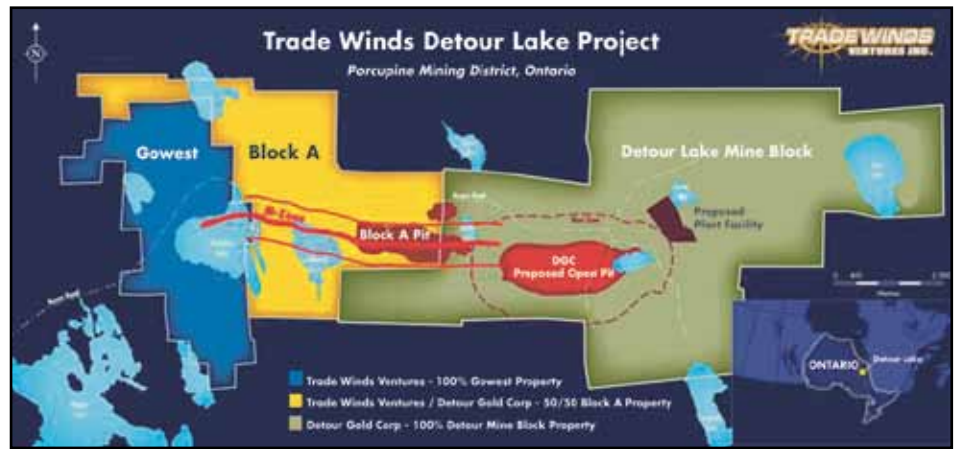
Trade Winds Ventures’ Block A property west of 14.9 million oz. developing gold mine.

“A significant number of results from the assayed samples have returned grades above the 0.4 g/t Au cut-off grade of the current open pit mineral resource estimate,” says Lambert, pointing out that more than 70% of the holes drilled to date contain assays of greater than 10.0 g/t gold.